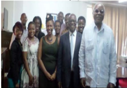
In August 2015 The DVA coalition met with Hon. Muruli Mukasa the, then Minister for Gender Labor and Social Development.

"I celebrate with all of you today because the Cabinet Memo on the GBV policy was unanimously passed. Everyone in Cabinet poured their hearts out on the need for a policy" said Hon. Peace.